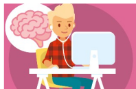
Understanding your teenager's brain